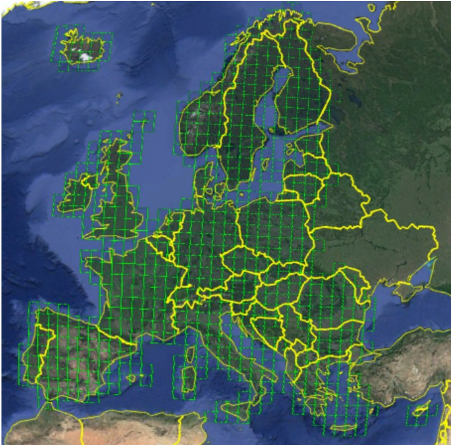
Figure 3 Ortho products grid.

For each tile there are two Geotiff files containing the vertical mean velocity and the east-west mean velocity. Associated with each Geotiff there is a .zip archive file, containing the previously specified CSV file (fields listed in Table 6 from top to bottom are stored as columns from left to right), and XML header file, (with the fields in Table 9). The name of the .zip archive follows the aforementioned convention, and it resembles the name of the contained CSV and XML files, apart from the .zip extension.